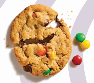
classic with M&M's®