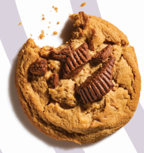
butter cup deluxe