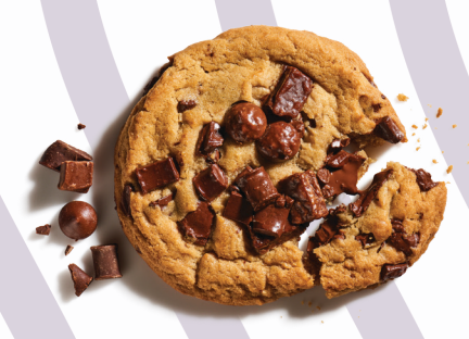
triple chocolate deluxe