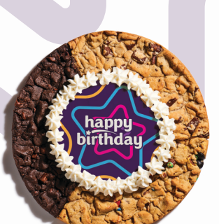
cookie cakes 10" and 6" cakes available in any classic flavor. triple threat and moon cake also available