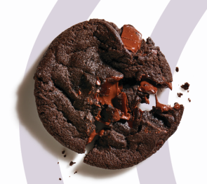
double chocolate chunk