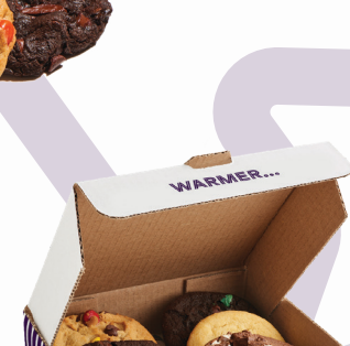
super six 5 classic cookies + 1 deluxe cookie