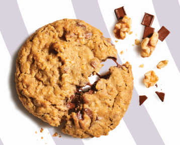
oatmeal chocolate walnut deluxe