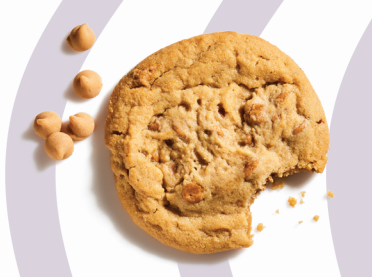
peanut butter chip